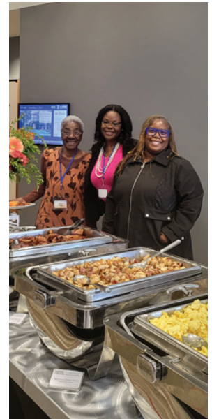
Conference at the I Hotel in Champaign, IL (Nov. 1, 2022)